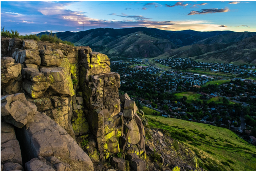
Golden, Colorado is one of my favorite places on the planet.